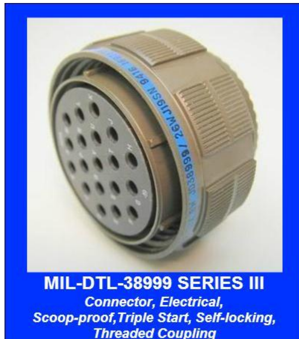
MIL-DTL-38999 SERIES III Connector, Electrical, Scoop-proof, Triple Start, Self-locking, Threaded Coupling