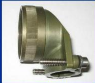
M85049/51 Right Angle Cable Clamp

M85049/51 S 10 W Basic Part No. _____ S = Self-Locking _____ -1- = Non-Self-Locking _____ Dash No. _____ Material and Finish Designator A = Aluminum, Black Anodize N = Aluminum, Electroless Nickel W = Aluminum, 1,000 Hour Cadmium Olive Drab Over Electroless Nickel