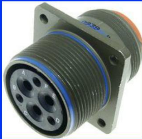
MIL-DTL-5015 SERIES III Connector, Electrical, Rear Release, Environmental Seal, Threaded Coupling